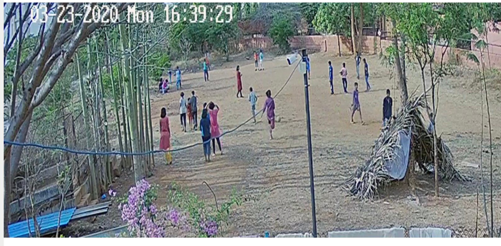
To end the days, the kids play outside after 4:30 p.m. (it's super hot now in Mysore so they don't play outside before then) for an hour and a half and burn off any extra energy.

The leaders switch groups every day to keep things interesting.